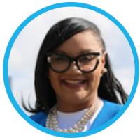
Congresswoman Nikema Williams Chair